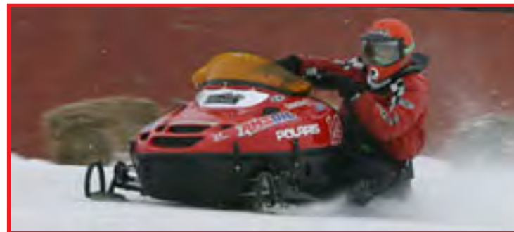
SERGE OUELLET #14 OF LACHUTE, QC WINNER ON SATURDAY OF THE SNOWMOBILE ICE OVAL PRO FORMULA 500 RACE AT THE GRAND PRIX DE VALCOURT.