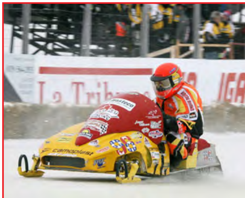
JACQUES VILLENEUVE IN ACTION AT THE 2009 GRAND PRIX OF VALCOURT.