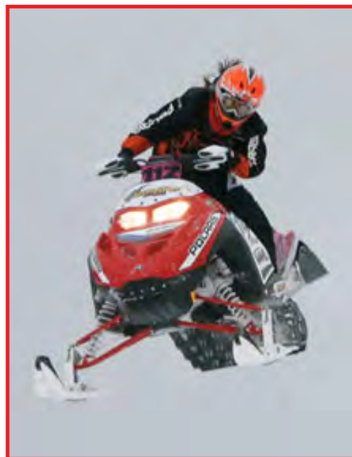
SNOCROSS ACTION START AT THE 2009 GRAND PRIX OF VALCOURT.

The Grand Prix of Valcourt will continue Saturday with ten Eastern Pro Tour ice oval finales and three final rounds of the Camoplast Snocross Championship. Motocross and ATV riders will make their first appearance at the Grand Prix of the weekend.